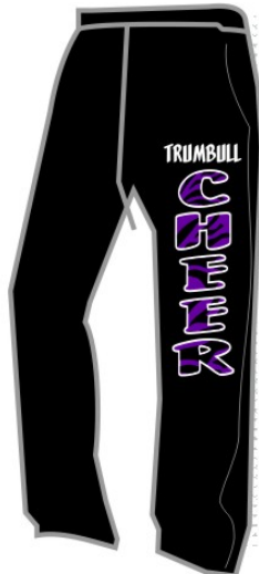
OPEN BOTTOM SWEATPANTS COLOR: BLACK $30.00