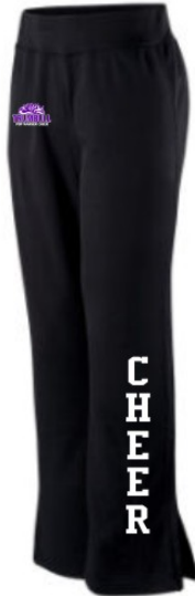
HOLLOWAY REFLEX LADIES & YOUTH COLOR: BLACK LOGO EMBROIDERED ON RIGHT LEG AND SIDE LEFT LEG $40.00