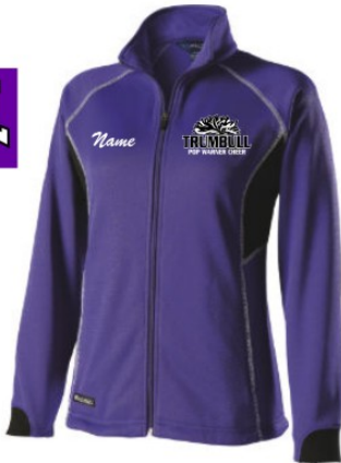
HOLLOWAY LADIES & YOUTH MOMENTUM JACKET COLOR: PURPLE LOGO EMBROIDERED ON LEFT CHEST NAME ON RIGHT TWILL LOGO ON BACK $70.00