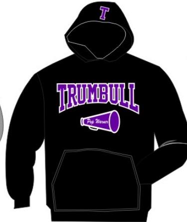
HOODED SWEATSHIRTS COLOR: BLACK TWILL LOGO ON FRONT $40.00 PERSONALIZATION NAME ON SLEEVE $5.00