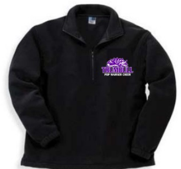
3/4 ZIP FLEECE JACKET COLOR: BLACK $35.00