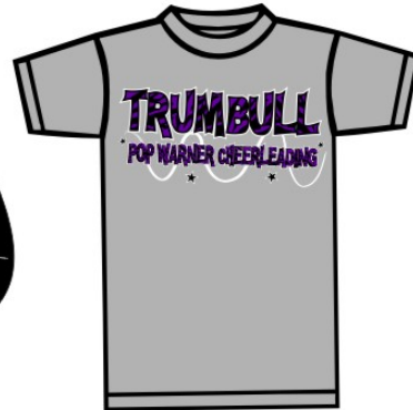
100% COTTON T-SHIRT COLOR: ASH GREY $12.00