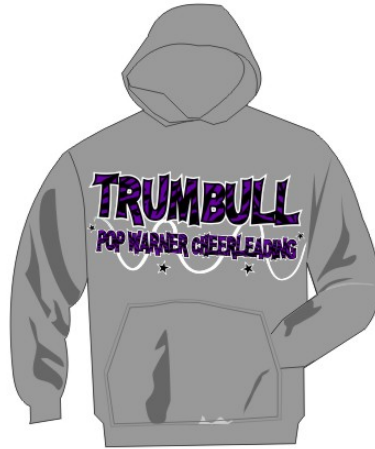
HOODED SWEATSHIRTS COLOR: GRAY LOGO PRINTED ON FRONT $30.00 PERSONALIZATION NAME ON SLEEVE $5.00